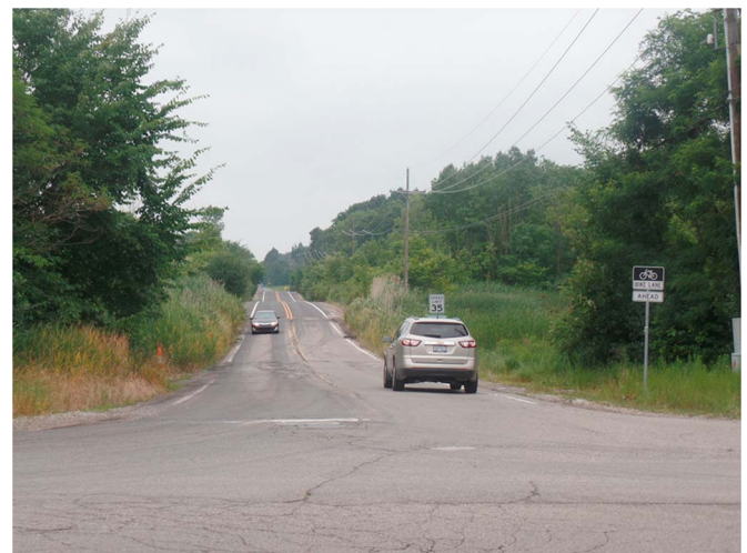
Fig. 2. Site of Nixon Condominiums (development will span both sides of Dhu Varren Road, pictured.).

Total accessibility is the sum of the accessibility in each zone I ( a_i ) and the population in each zone i. Accessibility for a given zone I is in turn a function of its travel costs to all other zones j ( f(c_{ij}) ) and the