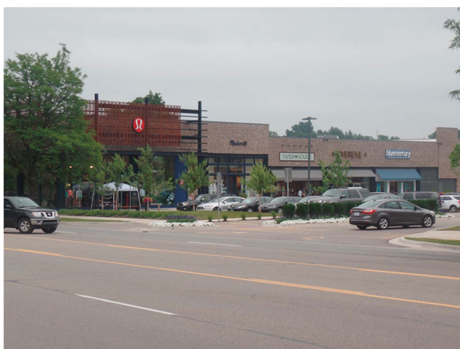
Fig. 4. Arbor Hills Entrance and Shops (Photo credit: Louis Merlin, 2015).