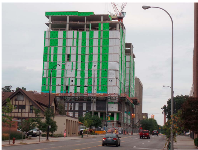
Fig. 3. Site of 413 E. Huron Street (photo credit: Louis Merlin, 2015).