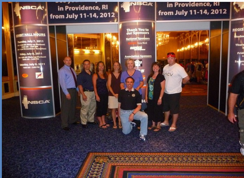
The Nutrition Special Interest Group