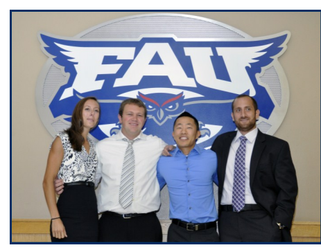
Graduation, Spring 2013