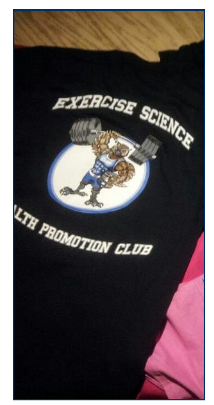
Our new ESHP Club shirts.