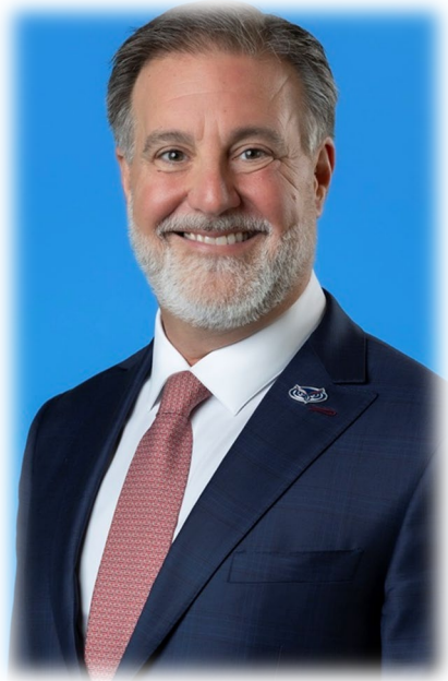
Florida Atlantic President