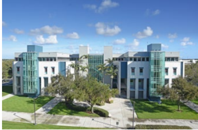
Boca Raton Campus