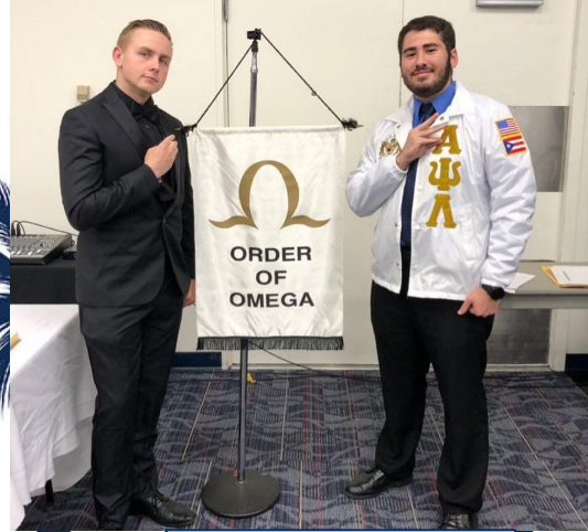
Order of Omega Induction