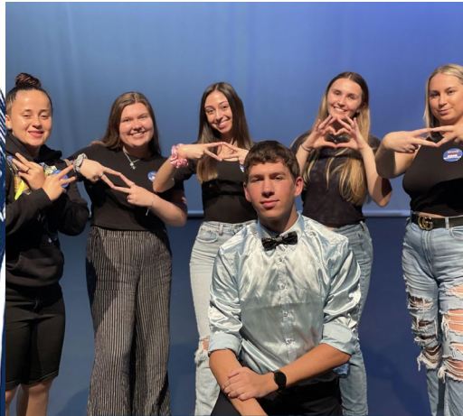
Greek Week Executive Board