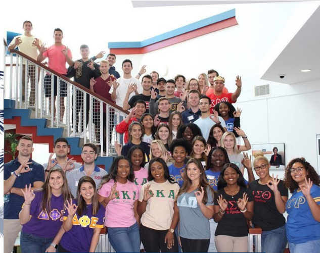
GOLD Retreat on the Jupiter campus