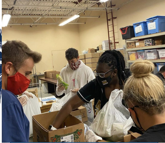
Alpha Psi Lambda and Pi Kappa Alpha members packing food kits