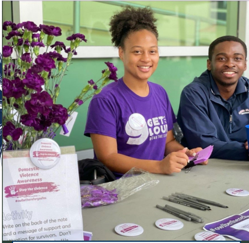
Campus Activism Domestic Violence Awareness Tabling