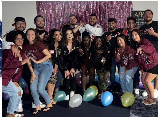
UGC Members at a council-wide event