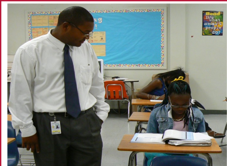
An A S-L student works in a classroom as part of a teaching practicum.