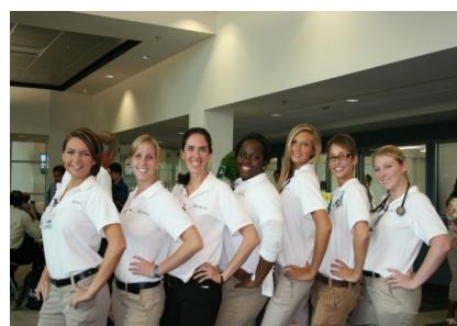
A S-L nursing students participate in the 2011 Earth Day Competition.