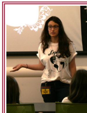
An A S-L student in the Explore LLC gives a presentation to local middle school students at a mini-career day.