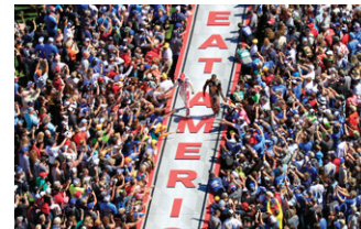
Enjoy Pre-Race Ceremonies!

CALL 1-800-PITSHOP AND MENTION THE "RACE REWARDS OFFER" OR VISIT WWW.DAYTONAINTERNATIONALSPEEDWAY.COM/SAVINGS AND ENTER: 2018REWARDS