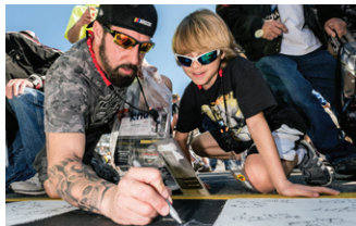
Sign the Start/Finish line!