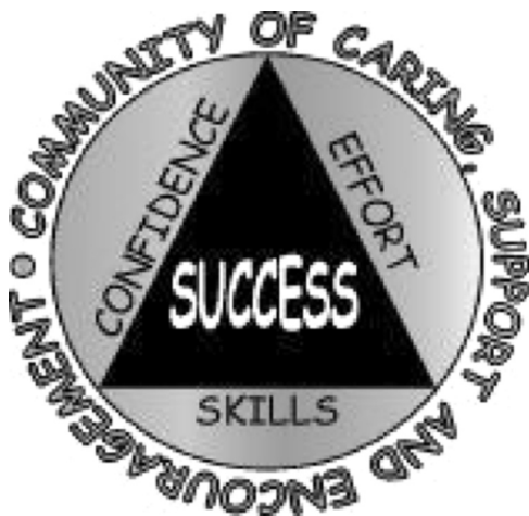
Figure 1 Student success skills logo.

2) I will respect the opinions of others even if I disagree. If I forget and give a put-down , then, I agree to say two put ups to that person. 3) What I say in here belongs to me and I can share it with anyone I want. What others say belongs to them, and I agree not to share it with anyone else outside of the group. 4) Everyone has the right to pass during any group activity.