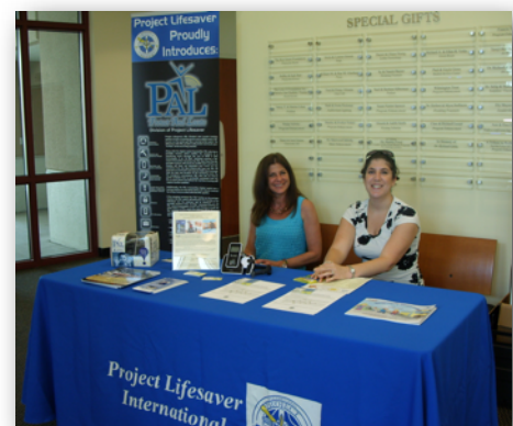
Project Lifesaver International