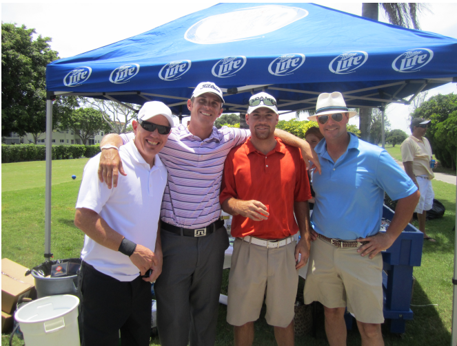
First place winners of the 1st Annual Irishmen Sports Pub & Eatery Charity Golf Tournament benefiting FAU CARD

We would like to express our most sincere gratitude to all of the families and agencies who have recently supported us through their contributions and fundraising efforts.