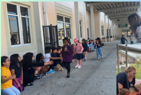
Westside K-8 VPK had a Vocabulary Parade in February!

There are so many great things happening at PRAISE schools and VPK classrooms!