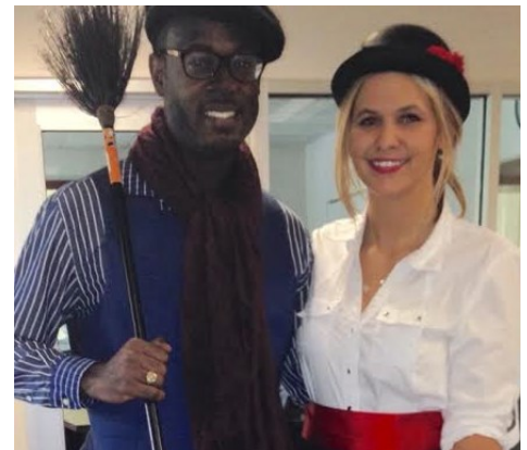
GA's dress as Marry Poppins and Bert