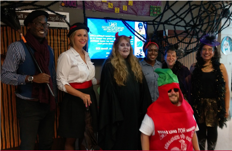
Waiting for the Henderson 4th graders to come trick or treat!

The Department of Teaching and Learning dress up for the Henderson students to Trick-or-Treat