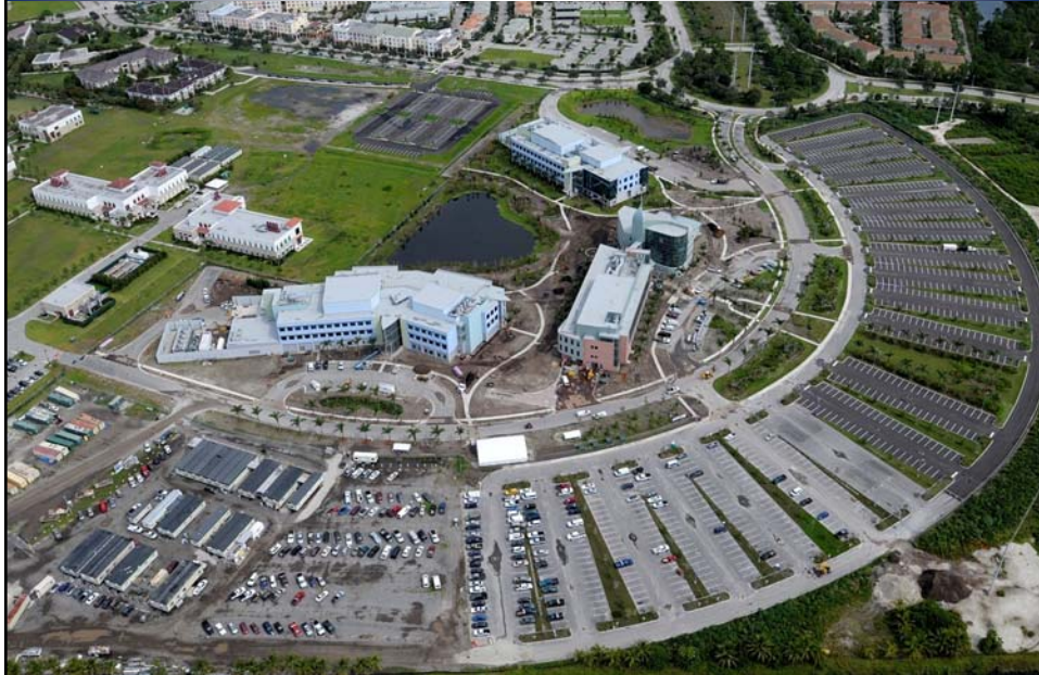
MacARTHUR CAMPUS, JUPITER – MASTER PLAN AMENDMENT