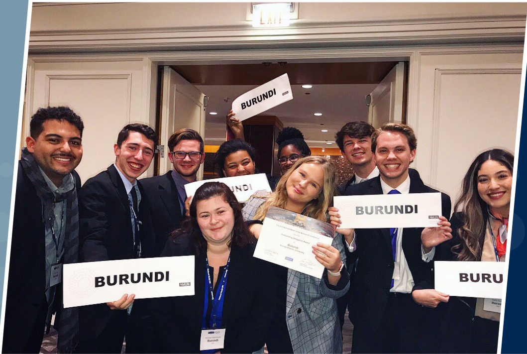
Students from the Leon Charney Diplomacy Program

We are also engaging new curricula for the University and regional community including non-profit management and leadership certificates and/or minor oriented toward the needs of area organizations including Jewish Studies content. We have listened and we are ready to respond.