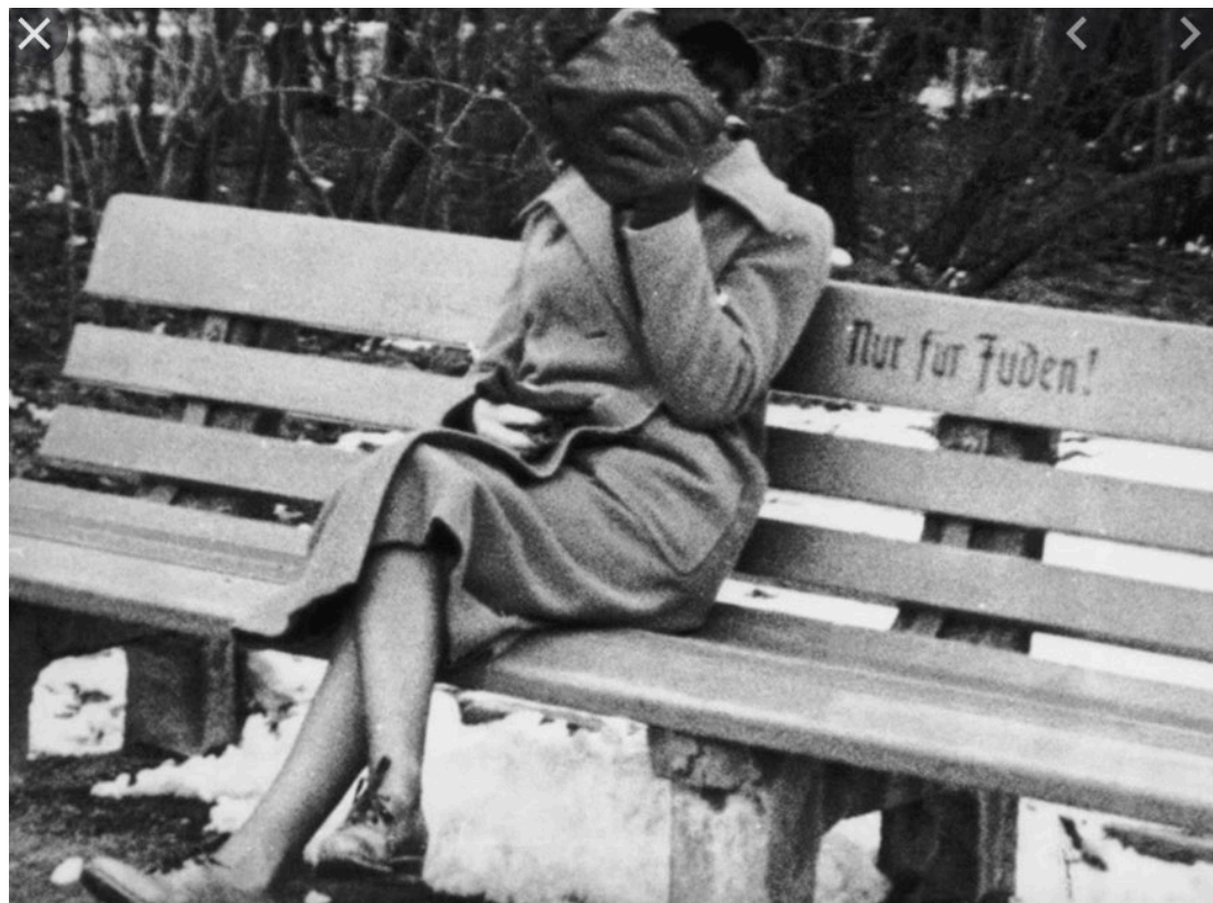
Only for Jews