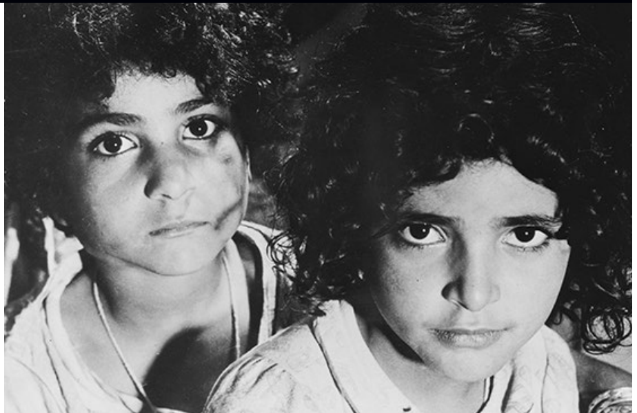
These Jewish girls of Moroccan origin lived in France's Los Arenas camp in 1946 while waiting to immigrate to Palestine.

Preserving Holocaust History through Artifacts, Archives, and Research