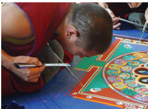
Image: Tibetan Sand Mandala

FRIDAY AND SATURDAY, MARCH 9 & 10, RITTER ART GALLERY / This annual exhibition presents children’s photography from several Boys and Girls Clubs in Palm Beach County. The exhibition is juried by volunteer experts from the community with the winners going forward to a national Boys and Girls Clubs competition. Organized and produced by the University Galleries’ Museum Education Program.