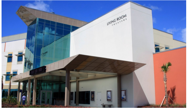
LLCL's new home in the Culture and Society Building