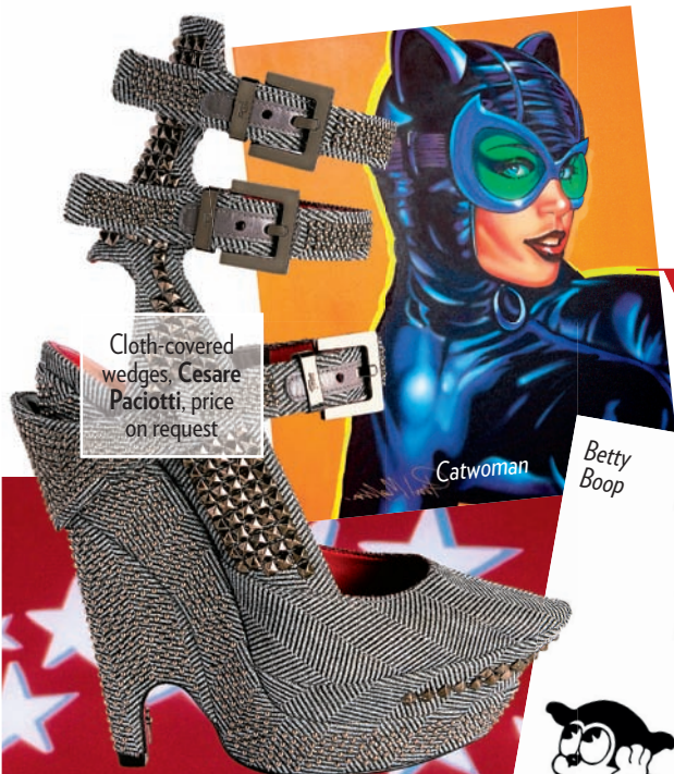
Cloth-covered wedges, Cesare Paciotti, price on request