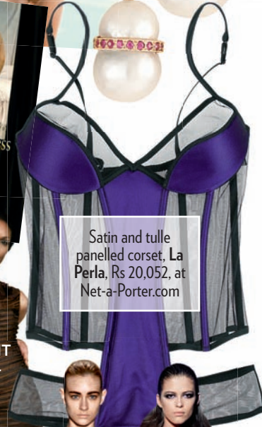
Satin and tulle panelled corset, La Perla, Rs 20,052, at Net-a-Porter.com