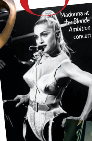
Madonna at the Blonde Ambition concert