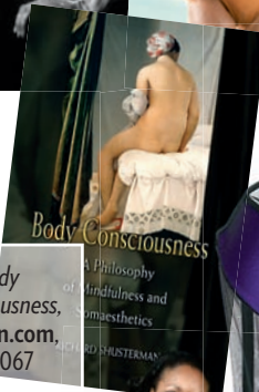
Body Consciousness, amazon.com, Rs 1,067

T hink sculpting your body with second-skin clothing, from high-waisted trousers or leggings to bodysuits. If the thought of shrink-wrapping yourself is scary, note that fashion's return to old Hollywood seduction has made body-con more contemporary and 'less spandexy' to create the illusion of shapeliness. Go ahead, channel Betty Boop's impish sexuality or recall Madonna's Blonde Ambition corset power. Body-con can be versatile and fun! Look out for Hervé Léger bandage dresses and do the skinny with Roland Mouret, Balmain and Emilio Pucci!