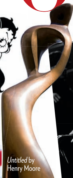
Untitled by Henry Moore