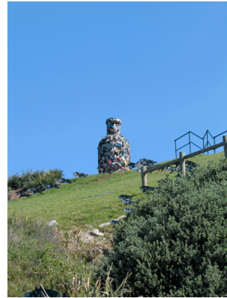
ABSOLUT DAHLSSEN, Sweden 2004