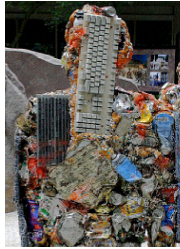
Trash People. Koln. Cologne People. 2006