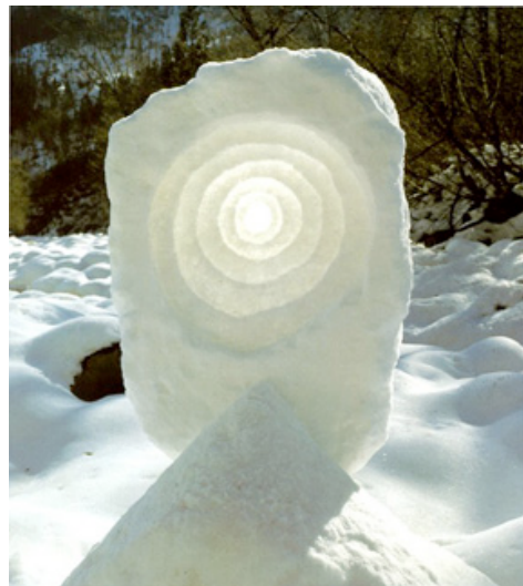
Bright sunny morning, rozen snow, cut slab, scraped snow away with a stick, just short of breaking through.