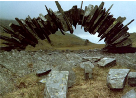
Slate arch made over two days, fourth attempt Blaenauffestynog Wales, September 1982