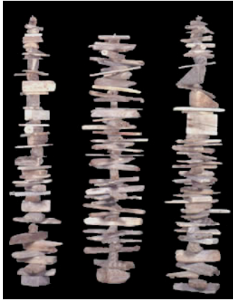
Driftwood Totems , found driftwood objects and stainless steel collected from Australian beaches.

http://www.johndahlsen.com/detail_commission/absolut_dahlsen.html