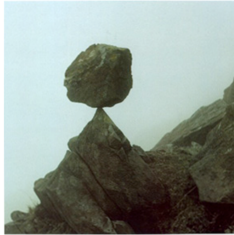
Balanced Rock Misty

Le jardin Massey, Tarbes, France, 22 August 1989