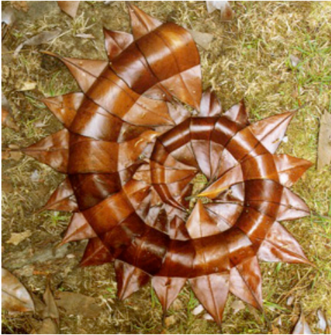
Leaves polished, greased made in the shadow of the tree from which they fell, pinned to the ground with thorns.

http://www.rwc.uc.edu/artcomm/web/w2005_2006/maria_Goldsworthy/works.html