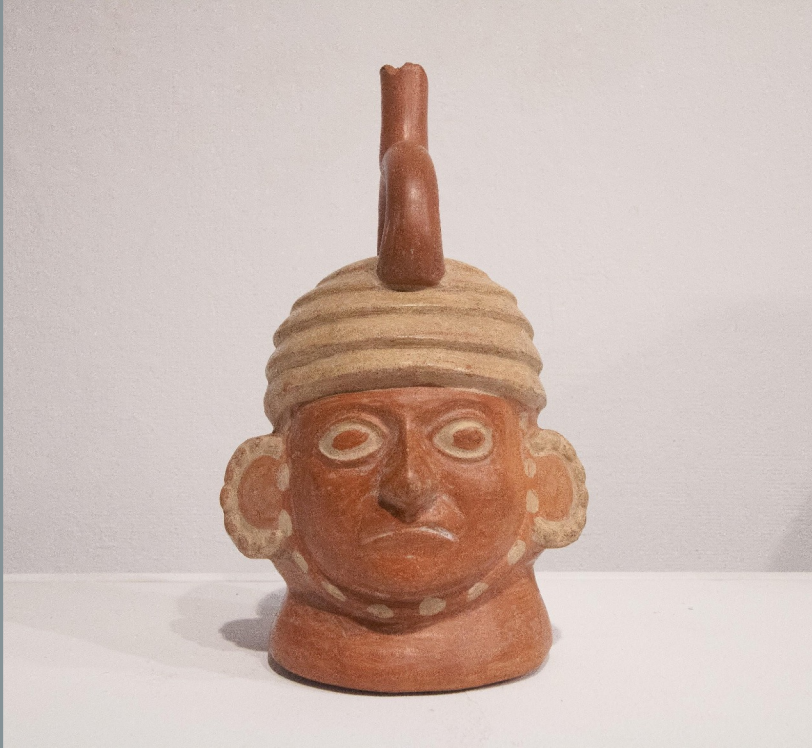
Moche Culture Stirrup Bottle with "Portrait" Head 200 BCE - 600 CE Ceramic

A mission statement is the beating heart of a museum. It articulates the museum's educational focus and purpose and its role and responsibility to the public and its collections