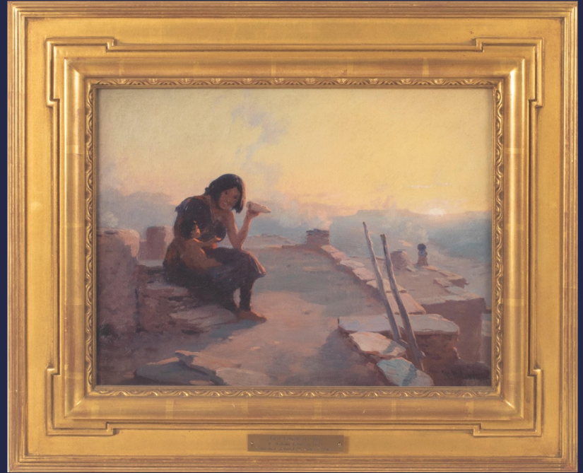
William Robinson Leigh First Lesson at Zuni Late 19th - early 20th century Oil on canvas board

An art museum or art gallery is a place where works of arts are shown for people to look at. These works of art are usually paintings, but they can also be sculptures, photographs or other visual art works. Most art museums are open for the public to visit, but there are also some which are private.