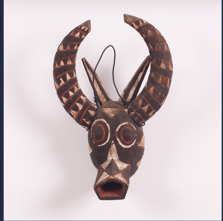
Unknown Abstract Animal Mask with Curved Horns Painted Wood

The Marketing and Communications Manager will ensure the effective delivery of the Museum's vision, mission and brand through all media outlets and platforms. This position ensures the Museum's brand is consistent across all platforms