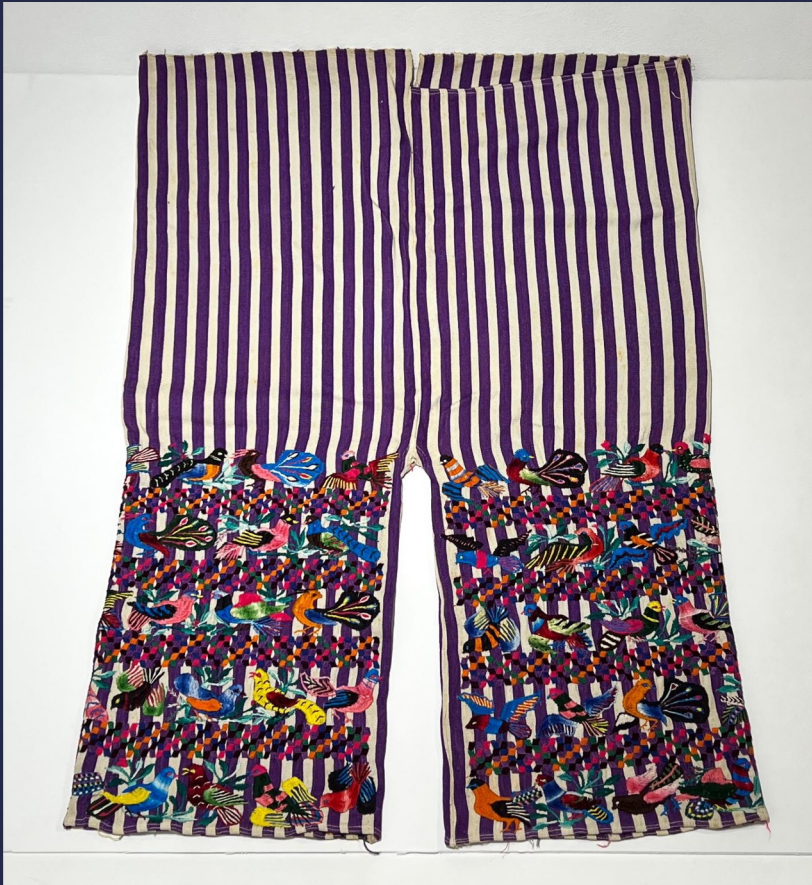
Santiago Atitl culture Men's Pants Circa 1964-1972 Garment