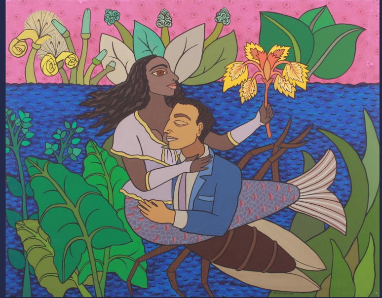
Alicia Leal La Pareja , 1999 Acrylic on Canvas

The curator makes decisions regarding what objects to select, oversees their potential and documentation, conducts research based on the collection and history, provides proper packaging of art for transportation, and shares that research with the public and community through exhibitions and publications.