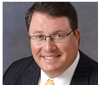
REP. RANDY FINE, Florida House of Representatives (R-Palm Bay)