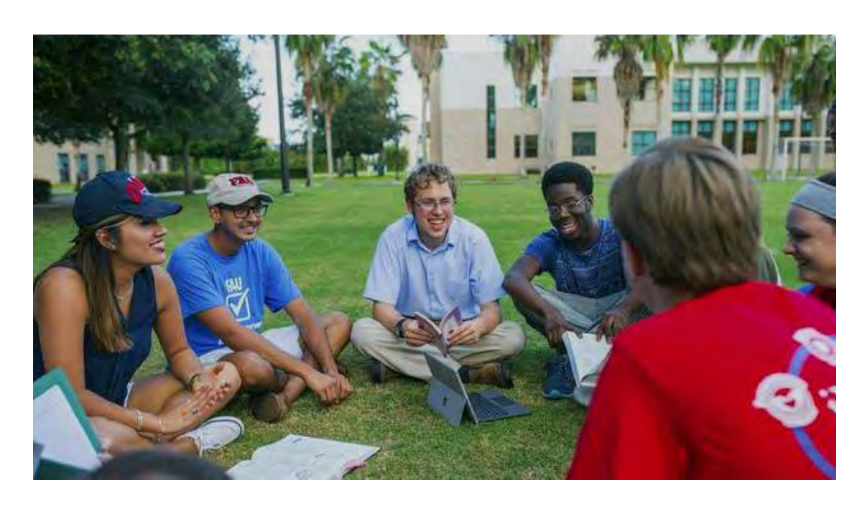
Annual Report of Activities Fiscal Year Ended June 30, 2017