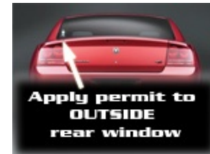
Example of where to place the permit

The permit must be affixed on the outside of the vehicle. Peel the backing from the permit and place it on the driver's side of the rear window. Permits MAY NOT be affixed inside the vehicle or by means other than the adhesive of the permit. A vehicle in non-compliance with applicable rules is subject to ticketing.