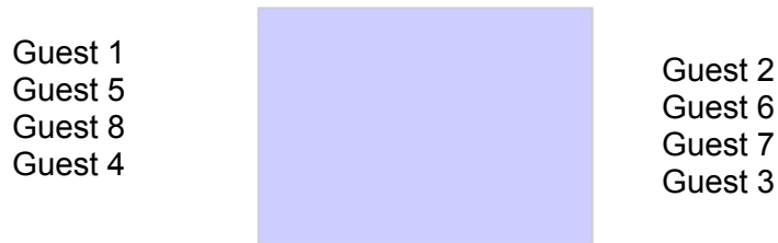
Table Host (most senior person)

The second approach considers seating based on rank and position. This means that gender or spouse is not a factor in placement. Seating is done by importance to the occasion and their "rank" in business, community, or institution. If spouses are included, the same rank is assigned to the spouse.