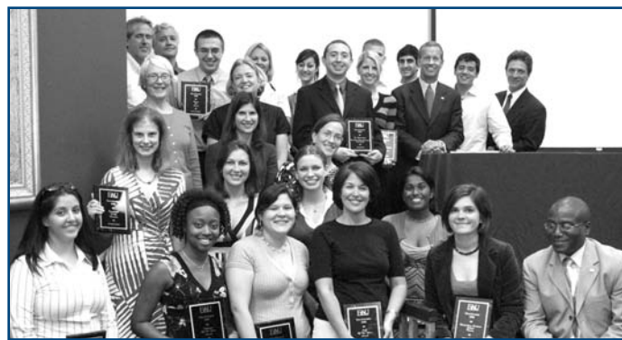
2008 MacAWARDS recipients

The 9th Annual MacAWARDS were presented on April 14 to recognize outstanding students, faculty and staff from the MacArthur campus.