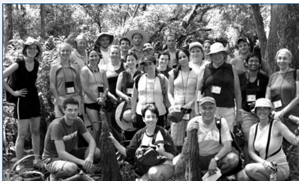
Journalists explore the Loxahatchee River

The Scripps Howard Institute on the Environment held its third annual educational fellowship for journalists at FAU Jupiter May 12-17. Twenty-one people participated, including 19 working print and broadcast journalists and two journalism graduate school students. Nine of the fellows came from Florida and the rest from California, Louisiana,