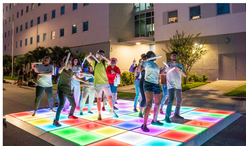
Updated: October 30, 2023