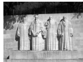
Reformation Park, Geneva

Not Included in the Fee: U.S. passport, tuition for 3 credits, spending money, books.