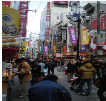
This is a street in Osaka, Japan. The street is lined with food carts and vendors.

new foods became easier through trial and error. Also, my language skills had increased steadily since my arrival. It was amazing to be able to try so many new things, and my favorite was certainly the food offerings. I loved eating Takoyaki , which is a fried dumpling made of batter, and then filled with octopus. Okonomiyaki was delicious as well. It consists of a pan fried batter cake that can be topped with anything you like, but mainly octopus, shrimp, or vegetables. Study abroad opened my eyes to a world that I never knew existed. Meeting new people in a place so different and so