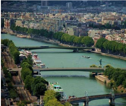
The Seine River

BLDG. 80 (SU), RM. 106 • 561.297.1208 WWW.FAU.EDU/GOABROAD