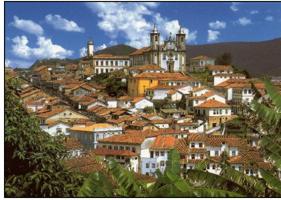
Belo Horizonte, Brazil