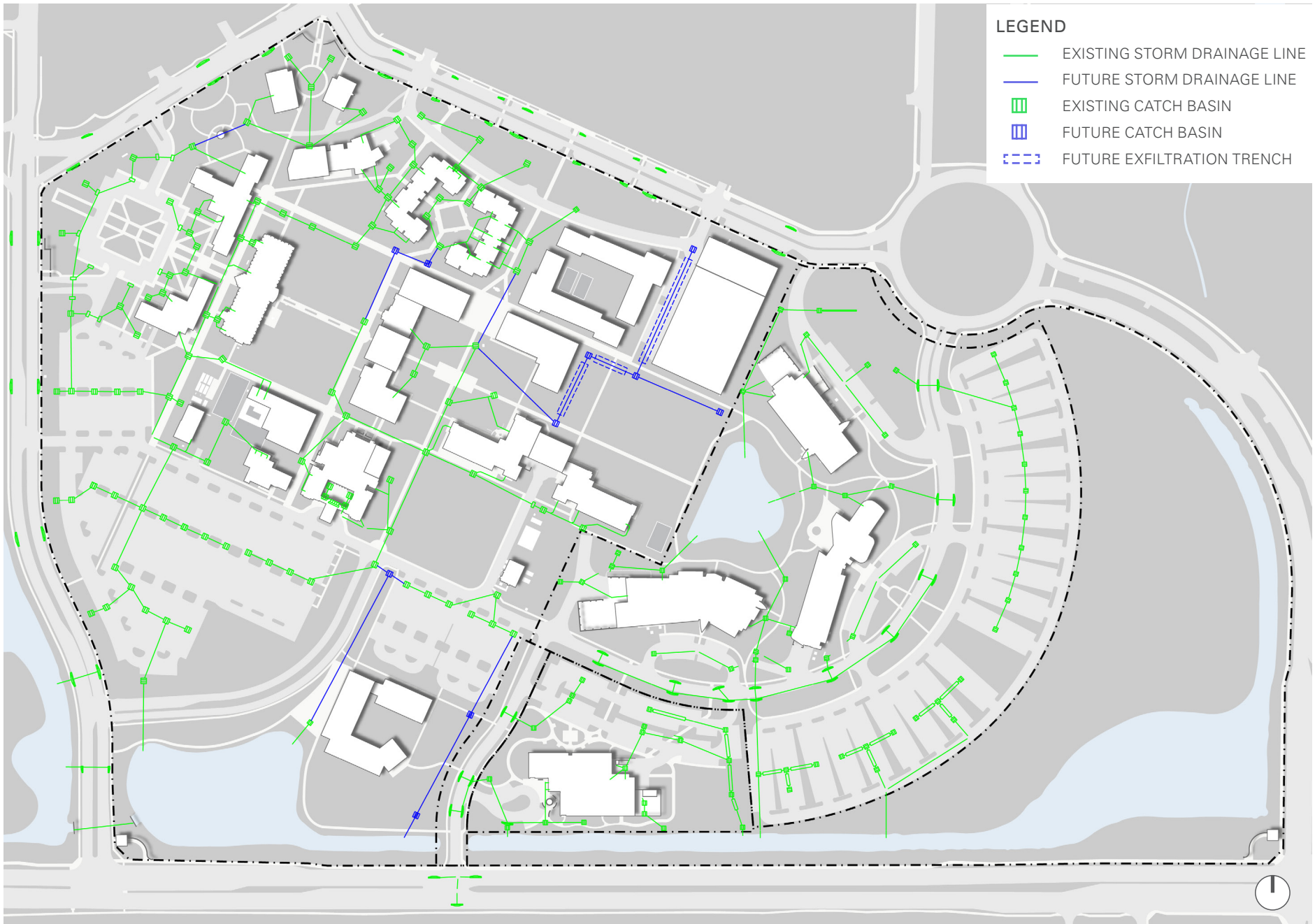
Figure 9.1 Stormwater Management