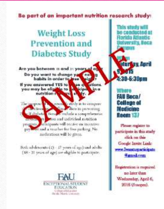
Sample study flyer