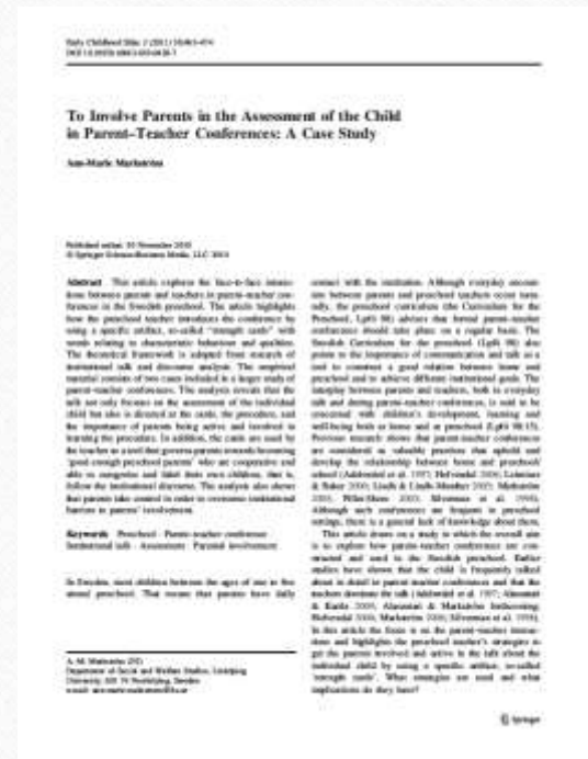
Research article sample