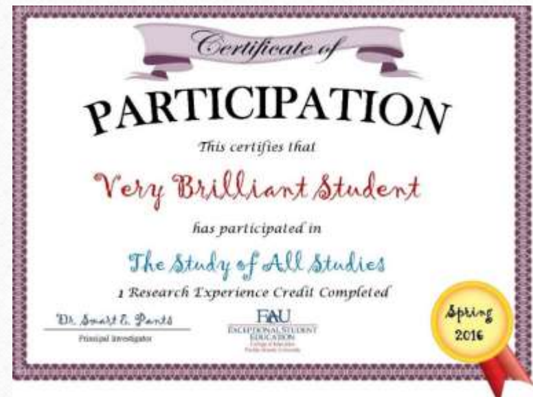
Sample Certificate of Participation