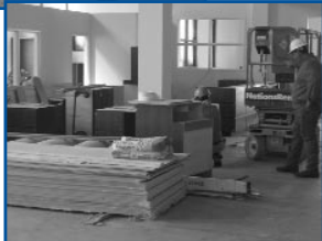
Workers install circulation desk in new campus library.