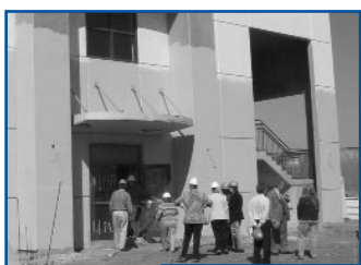
Faculty and staff tour new college of Education building