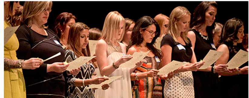
2014 MSW Induction Ceremony