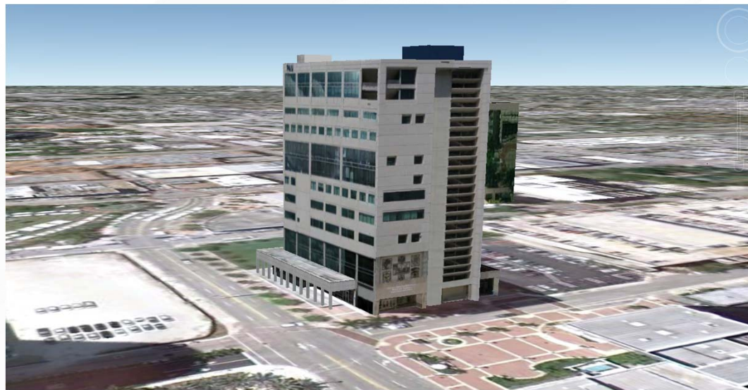
Google Earth 3-D Image of HEC Building Downtown