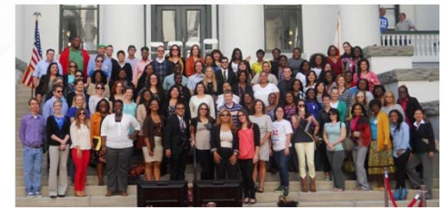
BSW & MSW students at Lobby Day in Tallahassee