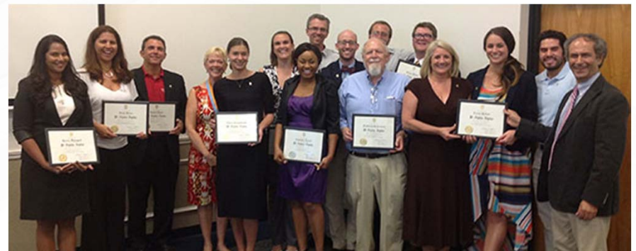
PA Honor Society Induction