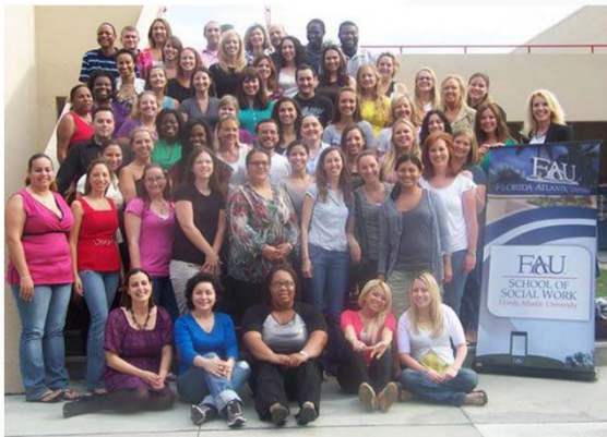
2010 MSW Graduates