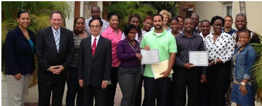
Workshop on Accountability and the Budget Cycle for St Maarten Government