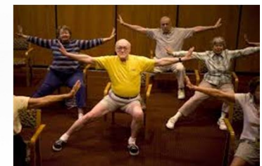
“Sit N Fit” Chair Yoga

Data Source -- AY 2012/2013 Departmental Dashboards & Institutional Effectiveness & Analysis Website