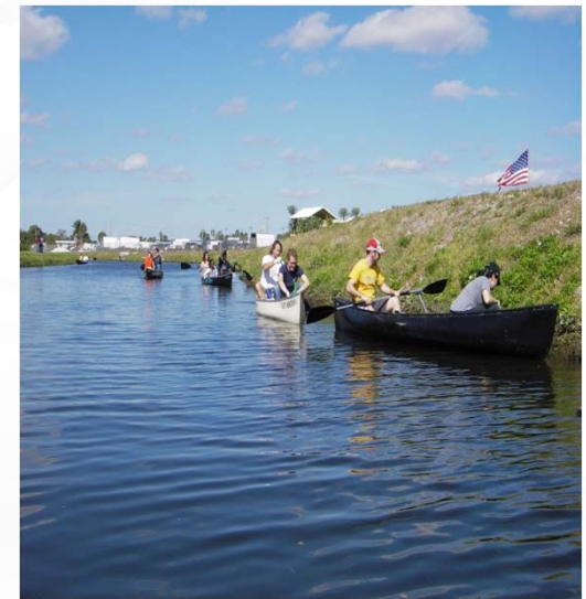
MURP & BURP students cleaning up the New River waterway

Data Source -- AY 2012/2013 Departmental Dashboards & Institutional Effectiveness & Analysis Website