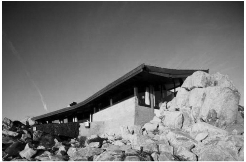
Boa Nova Tea House by Alvaro Siza, Portugal, 1963

Look at the photograph on this page and, using a pencil, redraw this view. Your drawing should show what you think are the most important characteristics of the scene. For your drawing, you may enhance or eliminate parts or details of the photo.