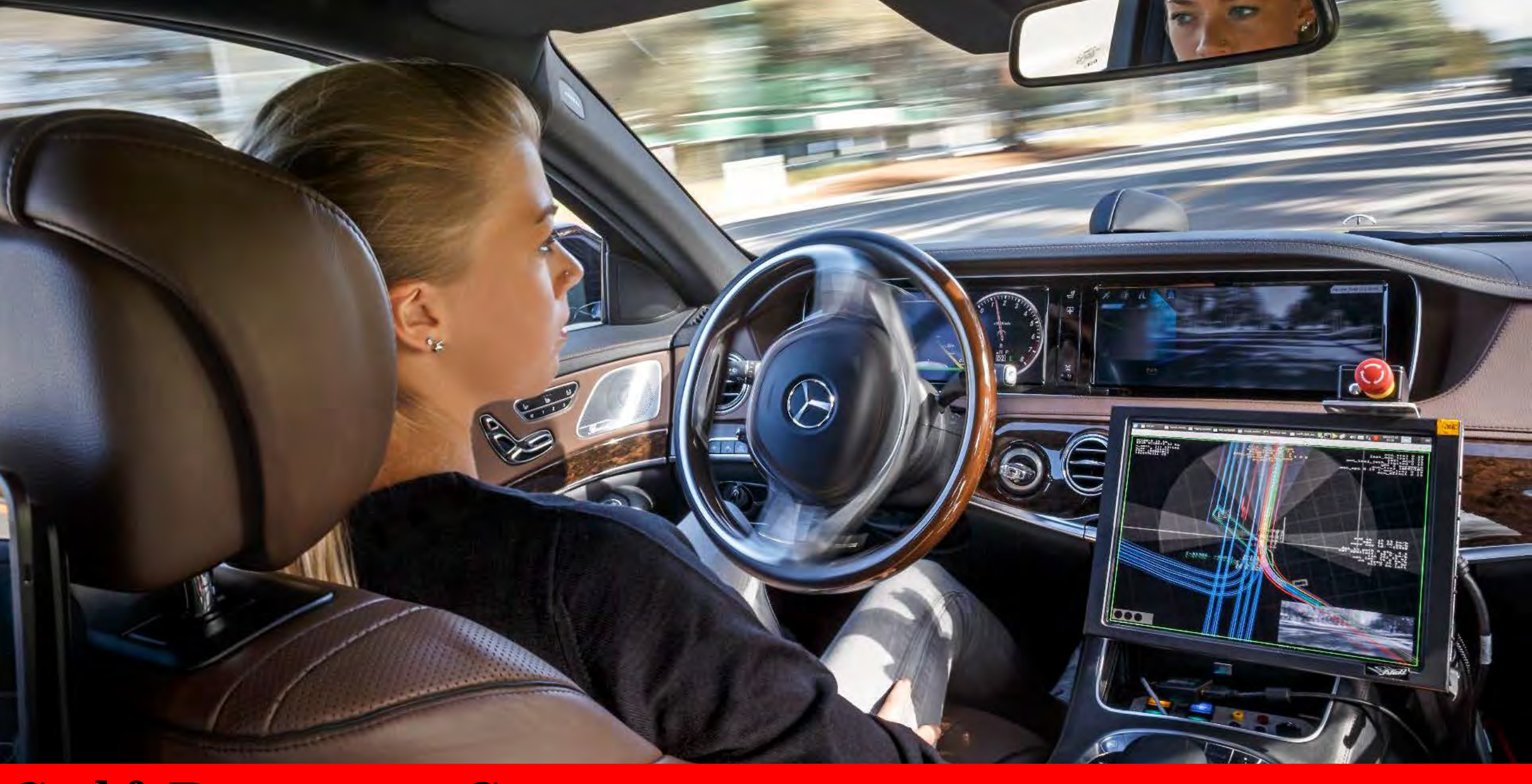
Self Driving Cars