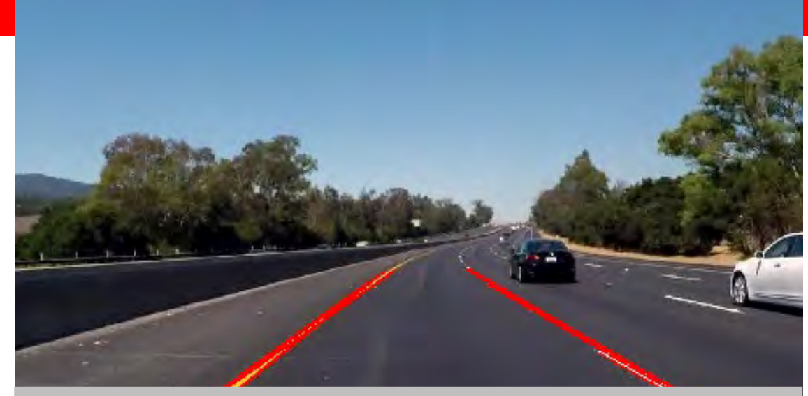
Hough Line Detection