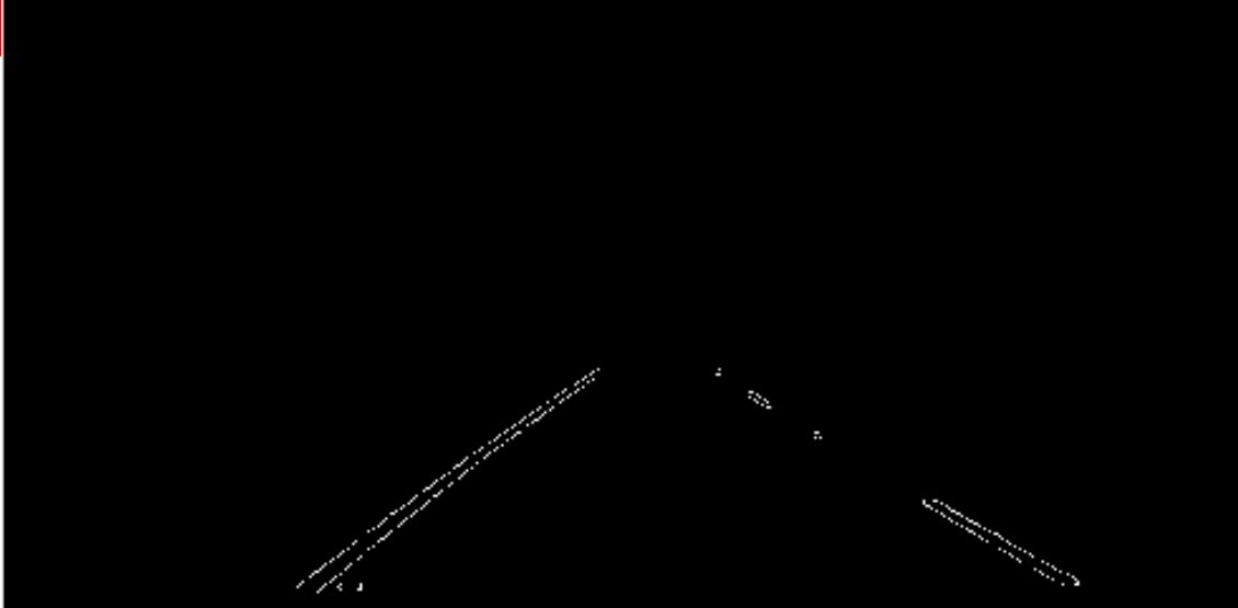
Region of Interest