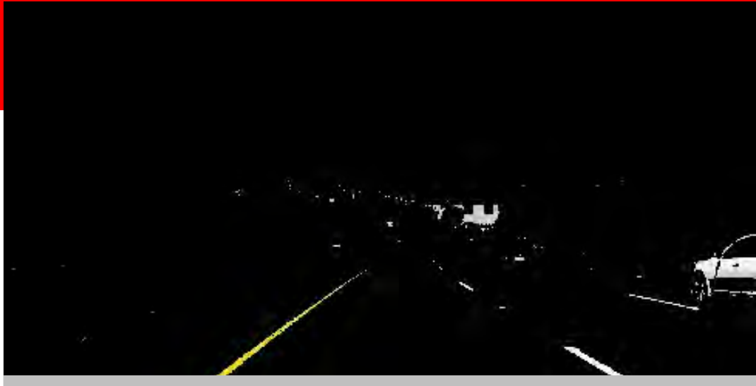
Yellow and White Color Mask