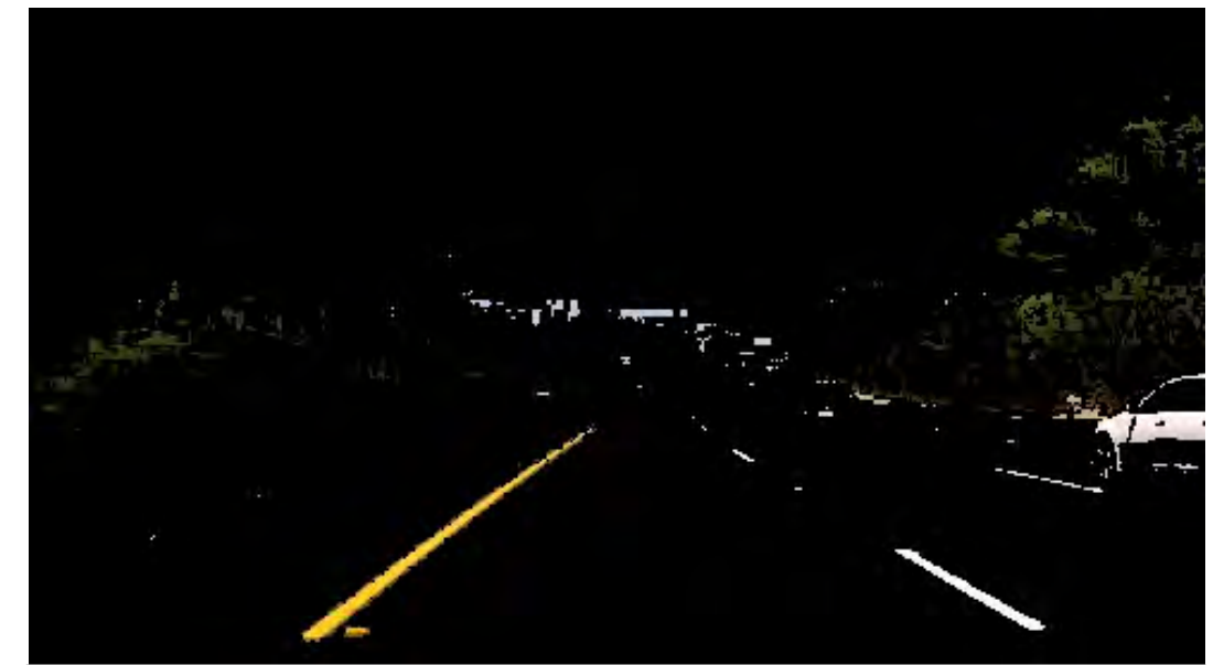
Apply Masks to HLS