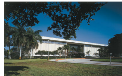
Kenneth R. Williams Administration Bldg.

Tel. (561) 297-3682 Fax (561) 297-2479 www.fau.edu/admin/oig mbarnett@fau.edu