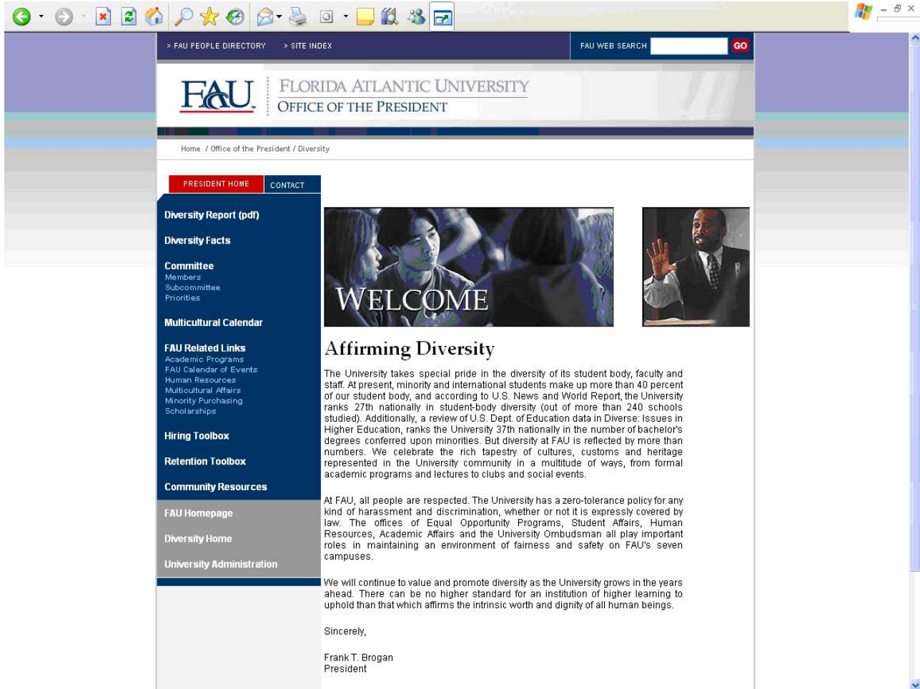
Image of the Diversity Website