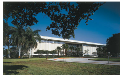
Kenneth R. Williams Administration Bldg.